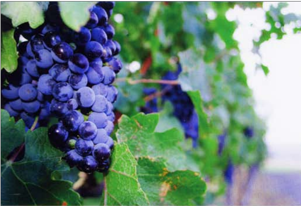
LEFT Cabernet Sauvignon hanging on the vine at Stillwater Creek