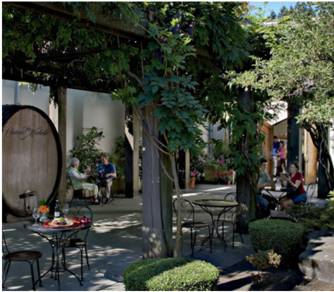
The courtyard at Chateau Ste. Michelle is a quiet spot to relax with one of the winery's many offerings.

tasting rooms. Vineyards are scarce, but along with easy access from the city, the main attraction here is the opportunity to meet so many eager young vintners in a rustic, laid-back setting. All but a handful of veterans have been in business for a decade or less.