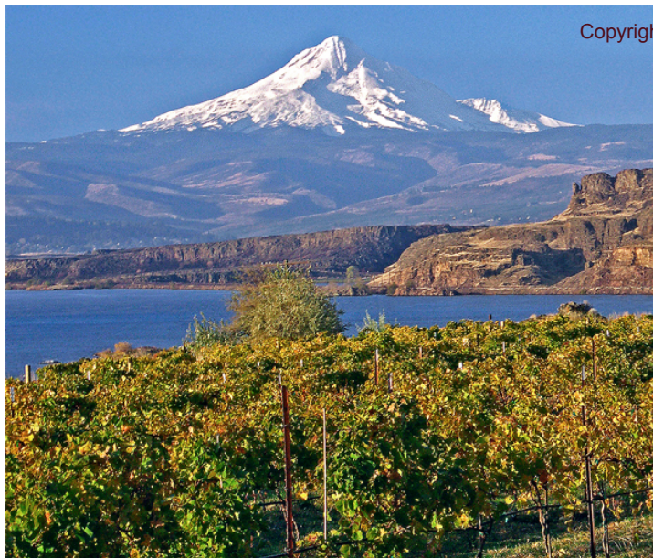
Parts of the Columbia Gorge offer stunning views of Oregon's Mount Hood.

Vineyard & Winery, which produces wines using grapes sourced from a century-old vineyard. A short drive away are Phelps Creek Vineyards and Wy'East Vineyards, arguably the region's best Pinot producers. Find a map at columbiagorgewine.com .