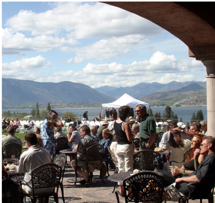
Guests overlook Lake Chelan from the concert grounds at Tsillan Cellars.

Join the Syncline Wine Club (membership is free) and you'll get invited to one of the region's best summer parties. The Syncline Wine Club Party, scheduled for July 20–21, is hosted every summer at the family-owned property and includes tastings of library and limited-release wines, a catered dinner, live music and dancing. Club members get 20% discounts on all their purchases as well as free tastings at the winery.